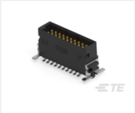
TE Part #254537-E SMCQ 20 M AB VV 8-03 CL * H007 137 E005