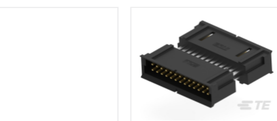
TE Part #284134-E STVC 96 F ABC VVV 7-00 EE 17,0 * 137