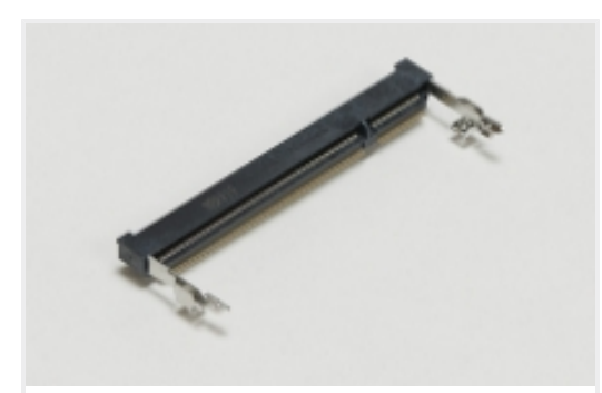
SO DIMM Sockets(39)