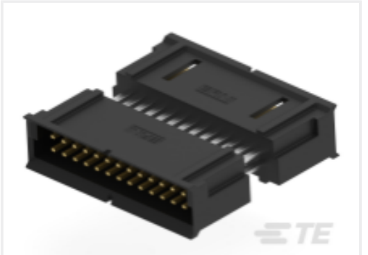
TE Part #364084-E DRCBTB 1,27 26 M BTB20 18,2 137 * 094 TR